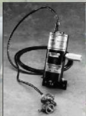
Detail of the pilot guard