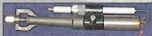
Detail of the pilot ignitor